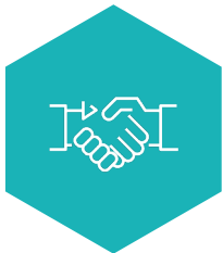
CLOSING & TRANSITION GUIDANCE