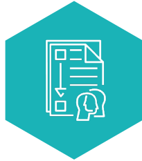
INDUSTRY SPECIFIC CONTRACTS