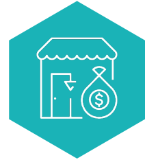
ASSET SALE OR STOCK SALE DOCUMENT PACKAGE