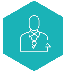
CONSULTING ON DEAL PRICE, TERMS, TAXATION, TIMELINE & FINANCING OPTIONS