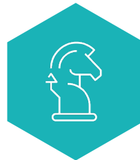
LOI NEGOTIATION CONSULTING & DRAFTING